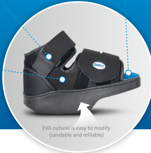
EVA outsole is easy to modify (sandable and millable)