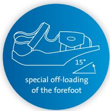
special off-loading of the forefoot