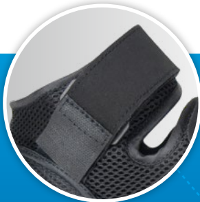
wide hook and loop fastener for use in a medial and lateral direction