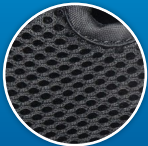
breathable mesh material